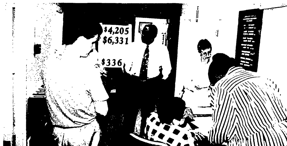
Volunteers work together to make Phonathon a big success.